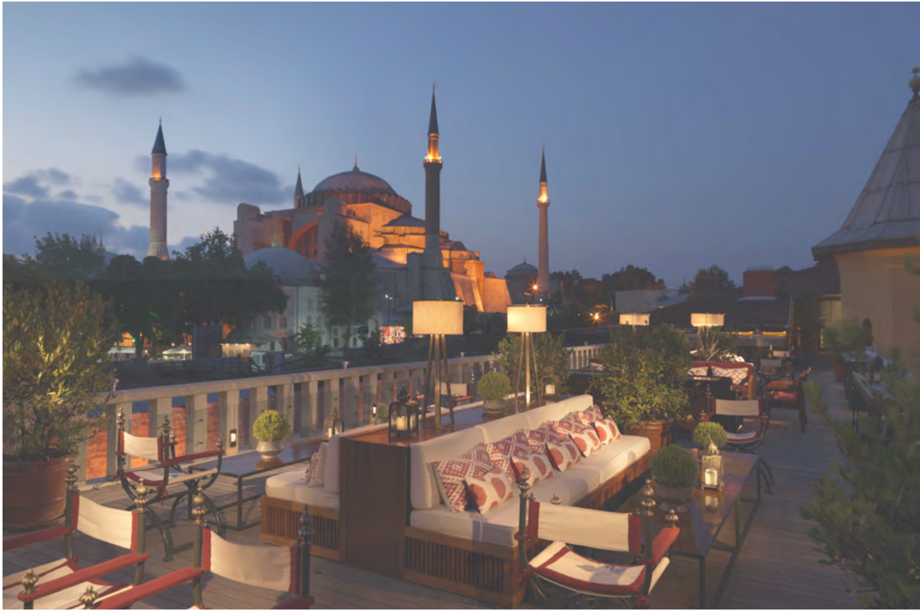
A'YA Lounge, a unique open-air terrace with a magnificent view of the Hagia Sophia and Blue Mosque, overlooking the Hotel courtyard and the Sea of Marmara is the ideal venue for an event to remember.